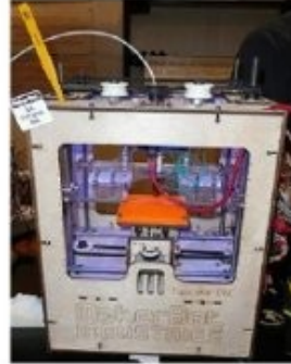
Rep-rap kit $875 (Makerbot)