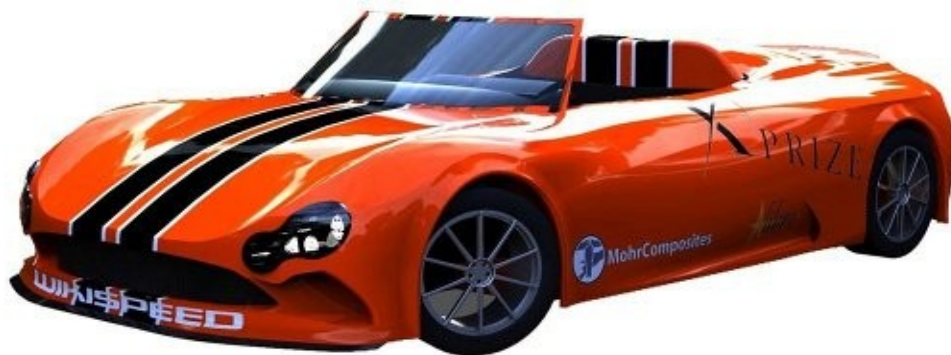
Fig. 3: The Wikispeed car

Wikispeed is a project focused on the development of an energy-efficient car (see Fig. 3 below). 4 What is especially interesting about the Wikispeed car is that it is developed by a global network of volunteers, who, by using methods drawn from the realm of open source software development, have managed to reduce development time and cost down to a fraction of that which conventional car manufacturing requires.