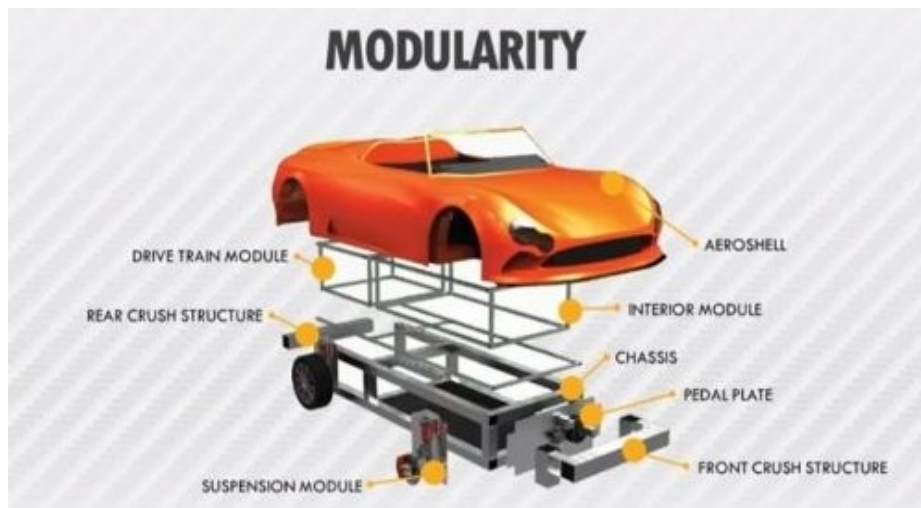
Fig. 4: The Wikispeed modular design

Second, modularity is the core design principle: Wikispeed is made up of eight components that can easily be removed and re-assembled (see Fig. 4 below). Such a product architecture makes it easy to modify and customise the car, for individual components can be modified without necessitating changes in the rest of the car. As a result, 'the whole car can transform from a race car, to a commuter car, to a pickup truck, by changing only the necessary parts' (Tincq 2012).