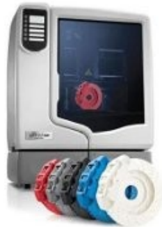
Stratasys (50 employees) low-end 3D printer $25-40K